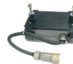
BEACON READER 100% compatible with SILEC beacons