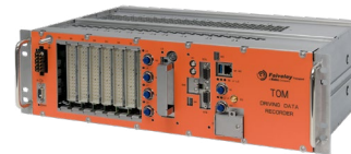
TOM Digital audio video recorder

ADS suite is a cloud-based solution proposing a fleet management application suitable for driving data automated collection and analysis of driving events.