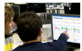
ADS - cloud services Automated detection of driving anomalies