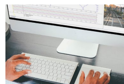
SAM User-friendly data driving analytic software